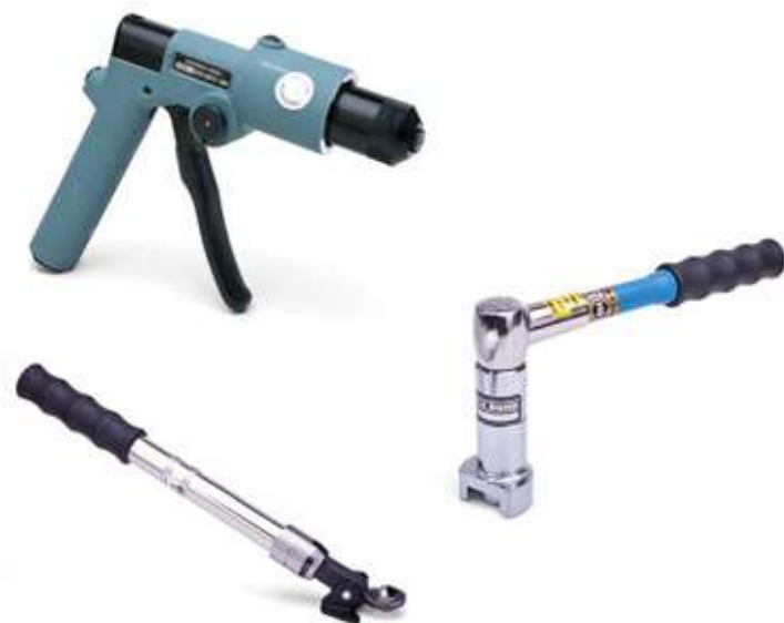
Product images not to scale.